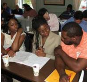
Images from the Southern Center's South Asia Workshop